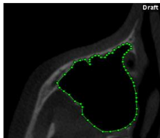
Figure.1 Maxillary sinus borders in coronal slice view. Figure.2 Maxillary sinus borders in axial slice view.